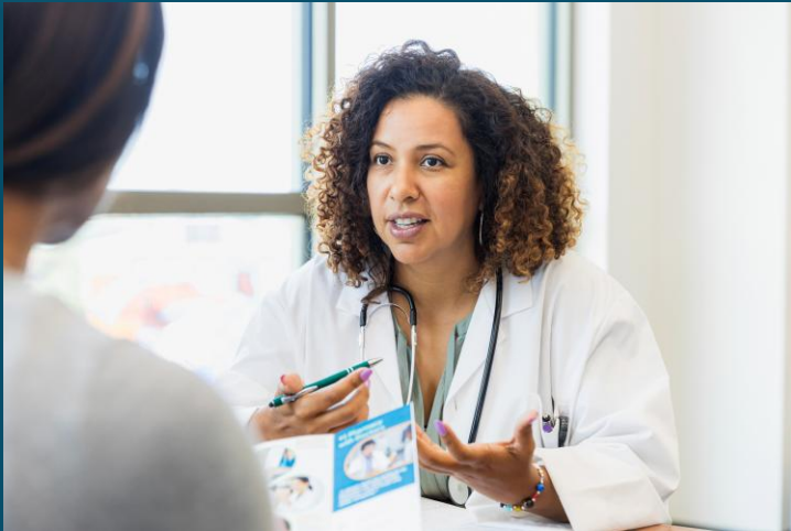
Accessible Medical Care