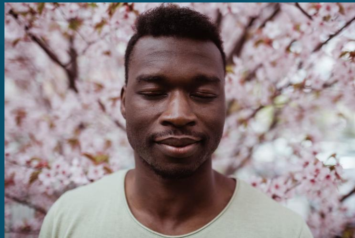
Accessible Mental Health Services