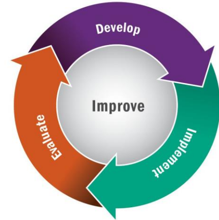
Continuous Quality Improvement Cycle